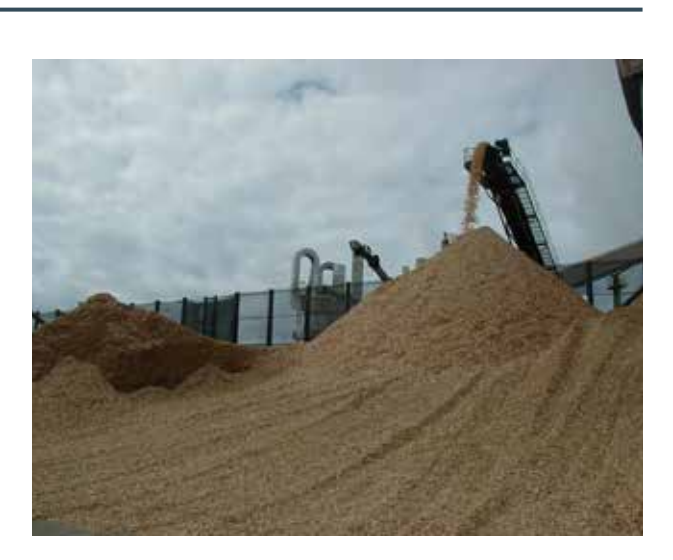
Pan Pac Forest Products