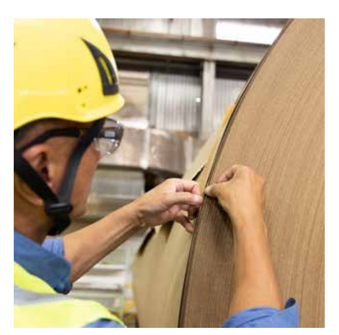
Oji Fibre Solutions