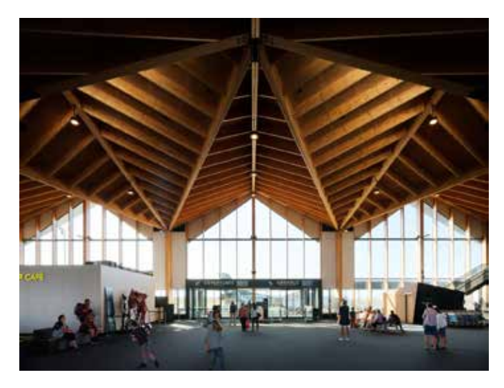
Nelson Airport (Hazel Redmond)