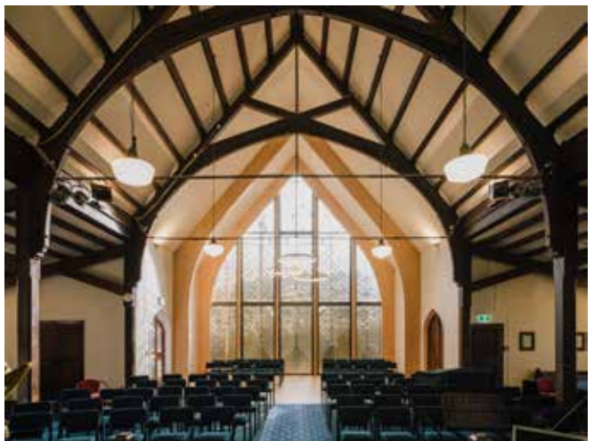
St Hilda's Anglican Church Island Bay (David Hensel)