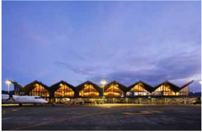
Left Photo: Tomomai ki Ahipara

Right Photo: Nelson Airport